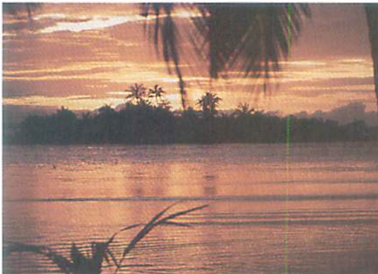
Convert between TGA, PCX, TIF, GIF, BMP, EPS