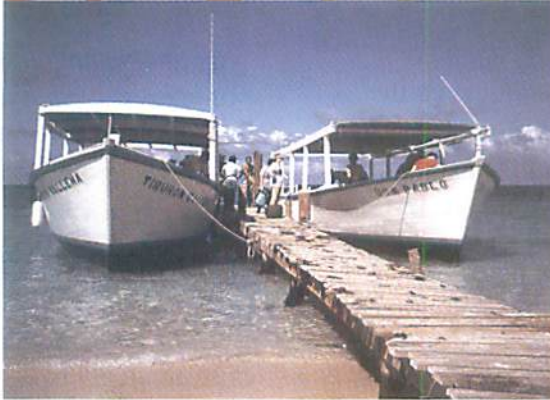
Resize an image to any new size

ChromaTools - image file conversion for professionals