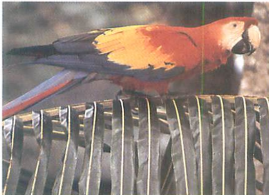
Optimized palette - incredible 256 color images!

ChromaTools is a powerful, easy to use graphics image converter for every PC user. Each day PC users are faced with graphics conversion problems that ChromaTools has the solution for including: