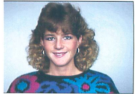
TARGA 16 image from video camera

8499 Greenville Ave., Suite 205 Dallas, TX 75231 USA Phone: (214) 343-4500 Telex: 4945693 VIDTX Fax: (214) 348-3821