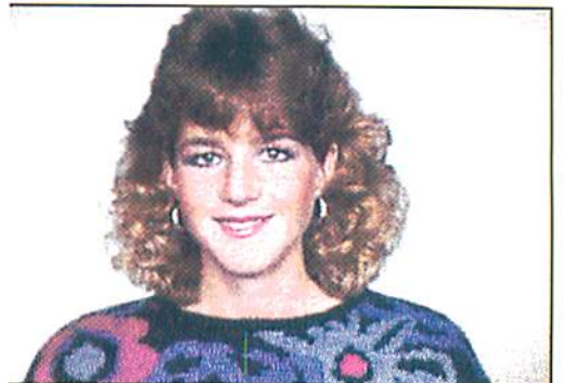
EGA 640x350 in 16 colors

This brochure created entirely electronically with T-EGA, SCAN-T, and Ventura Publisher, then separated by T-SEP and printed on a Linotronic 300!