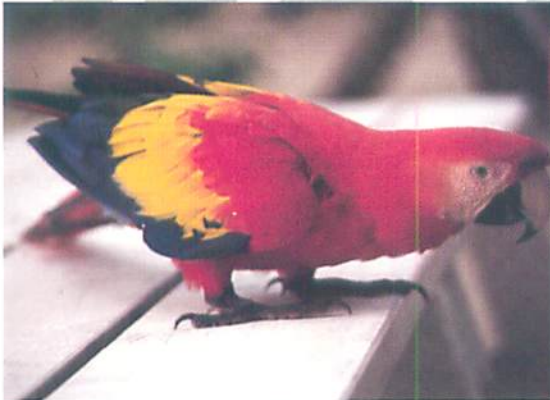
The macaw is captured as a Targa 16 file