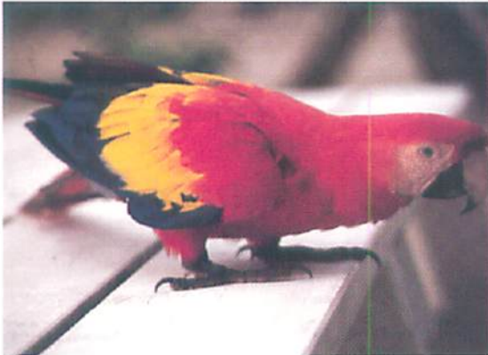
T-EGA converts it to VGA 640x480x256