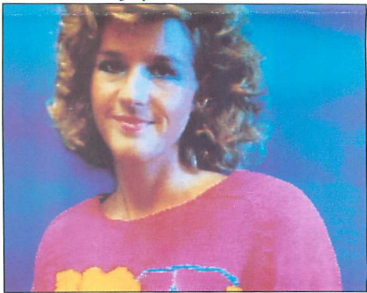
VGA 320x200 IN 256 COLORS Actual image converted from ICB above