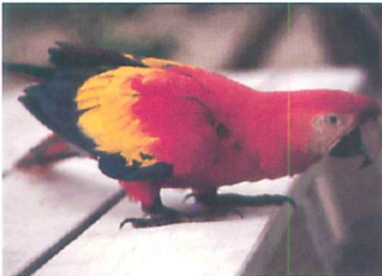
T-EGA converts it to VGA 320x200x256

T-EGA converts TARGA images to super-VGA, VGA, EGA, CGA or Hercules screens. T-EGA operates either with or without an image capture board. After converting the TARGA image to the PC screen, T-EGA automatically saves it to PCX, GIF or PIK formats. To save the screen in another format (like Show Partner), simply use that application's own graphics screen grabber to save the converted screen in that format.