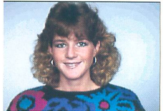
VGA 320x200 in 256 colors