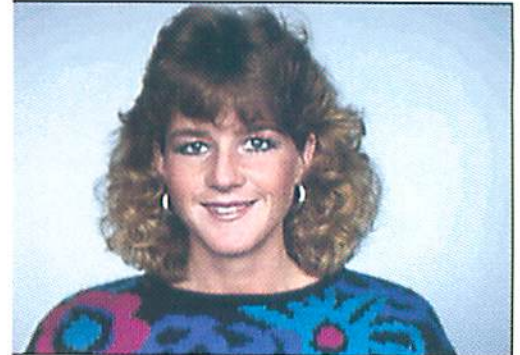
Extended VGA 640x400 in 256 colors