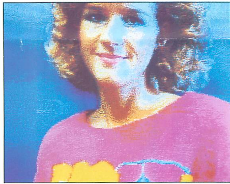
EGA 640x350 IN 16 COLORS Actual image converted from ICB at top

CALL (214) 343-4500 to order or find the nearest dealer